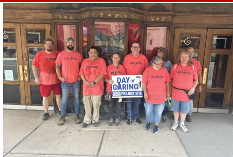
Mifflin Juniata Day of Caring